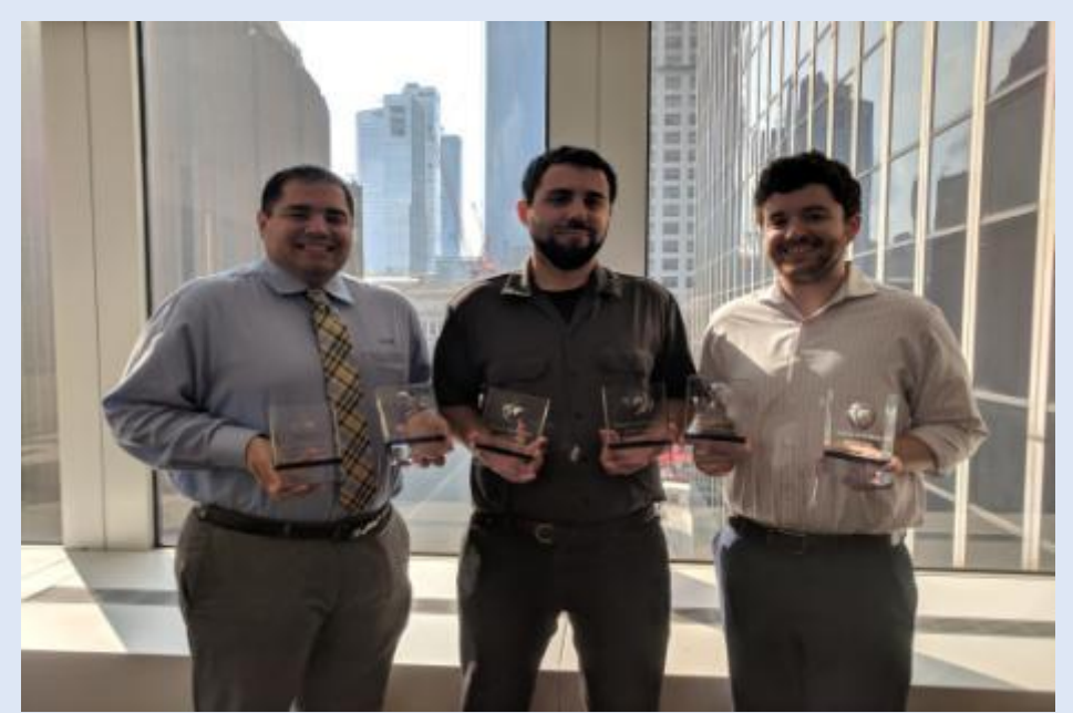
The Champions, "Just Crazy Enough To Work" from WSP (United States) with their awards.